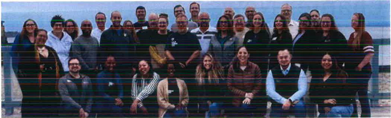
REGION 1 - Fall ROC 2024