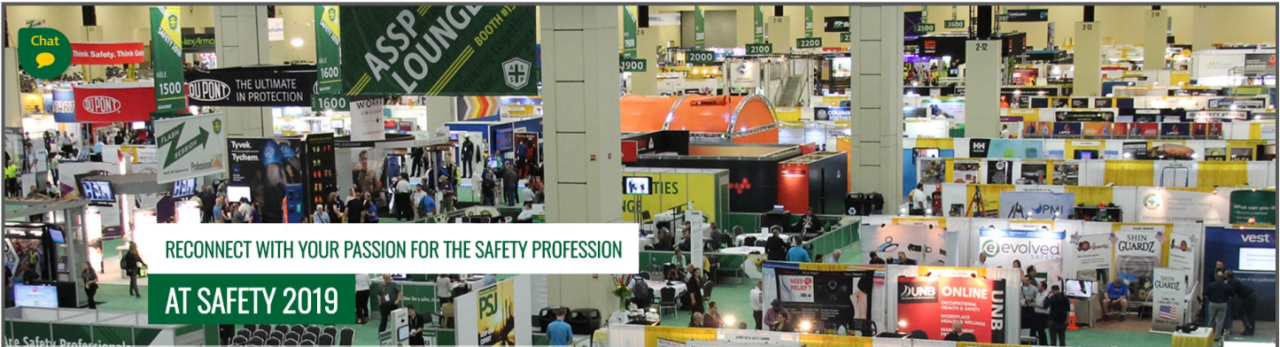
Safety 2019 Professional Development Conference & Exposition.

American Society of Safety Professionals is your source for insights on trends in the safety profession, including developments in safety management, worker safety, government and regulatory affairs and standards.